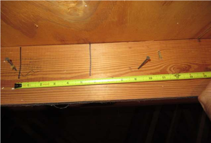
6" spacing in the field