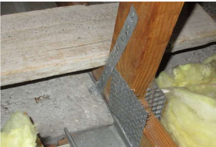
Single strap with at least 3 nails into the truss