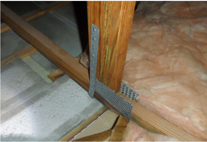
Single strap with at least 3 nails into the truss