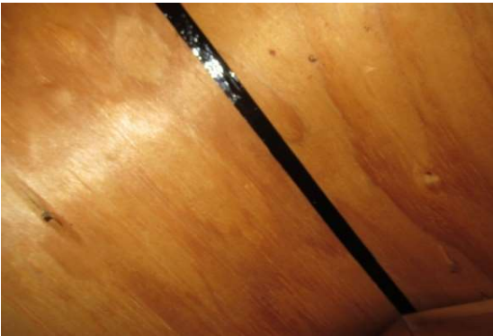
SWR installed under the tile