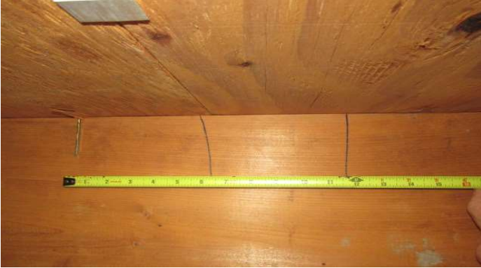
6" spacing in the field