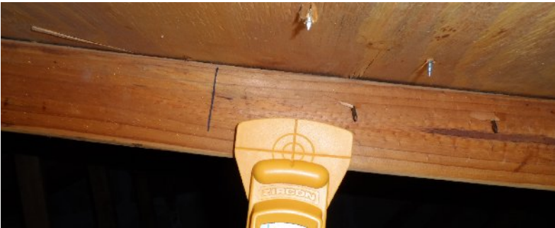
Nail location verified