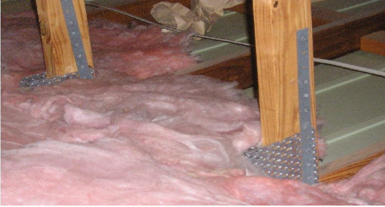
Single strap (clip) with at least 3 nails into the truss