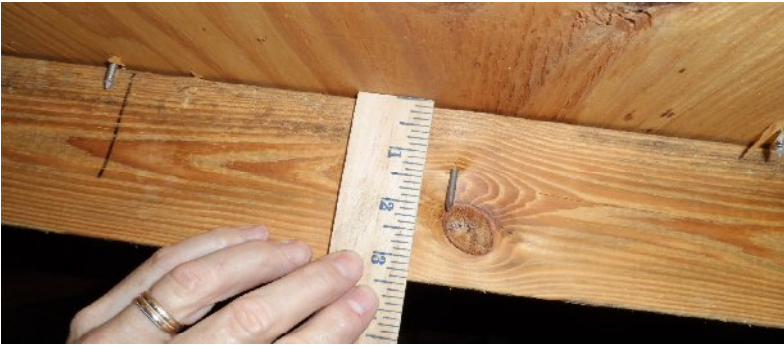
8d nails verified