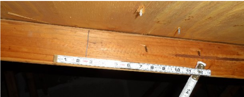
6" spacing in the field